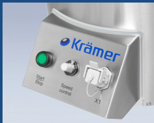
Continuous speed regulation