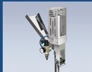
Option: Empty capsule sorter