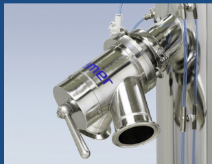
Option: Product Diverter KV2010